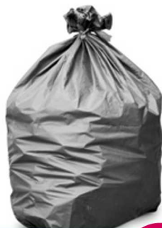
Black bags of waste or recycling