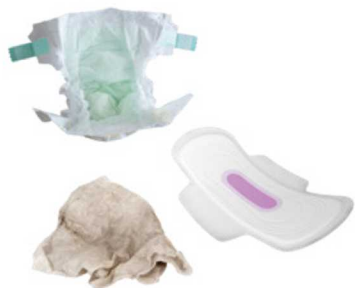
Wet wipes, nappies, sanitary towels and kitchen roll

If you place the wrong items in your recycling bin, it may not be collected. Please check your council's website for more information about what is and isn't acceptable. When the wrong items are placed in the recycling, this reduces its quality and can cause large quantities of materials to be rejected and not recycled. This means your Council Tax money is wasted , instead of being spent on improving local services.